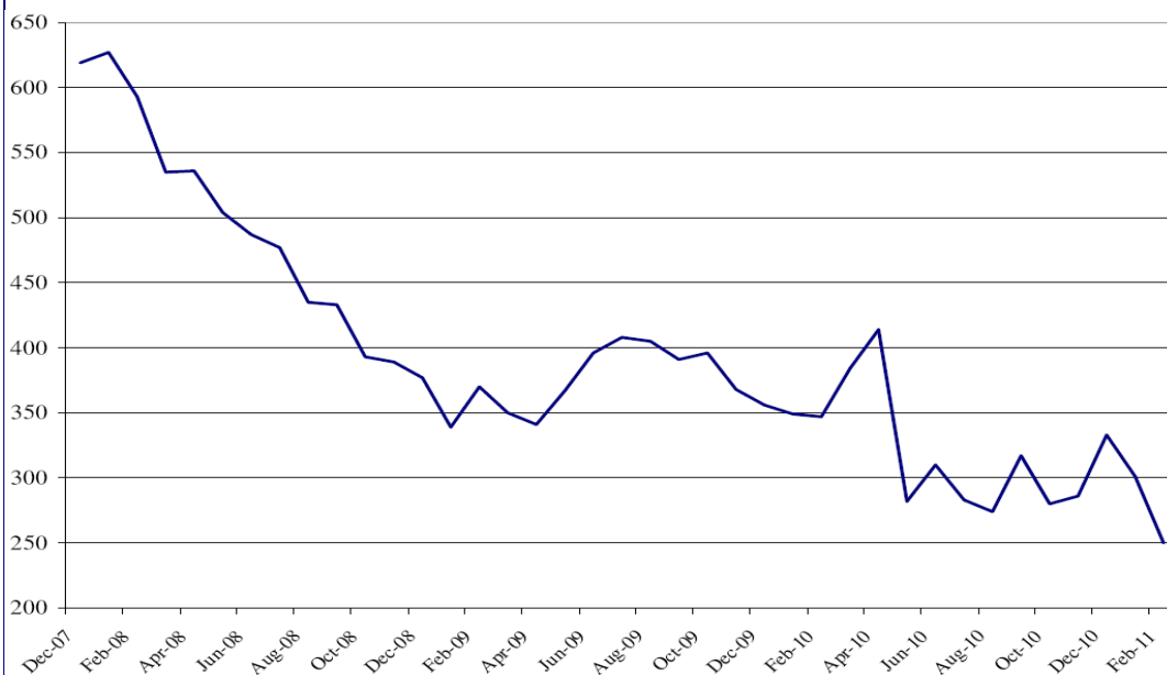
Figure 1. Monthly New Home Sales (000's) since 12/31/07

The reason for the Fed's dovish language and outlook: the U.S. is still combating serious headwinds that are preventing a more robust economic recovery. The labor market and the housing sector are still struggling to gain momentum. Although the labor market contin-